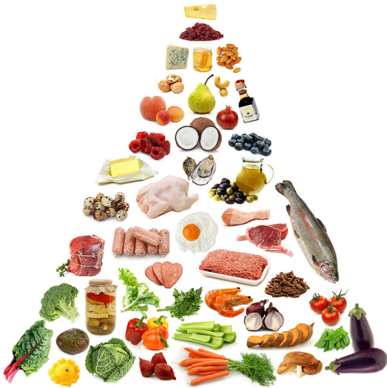
The Real Food Pyramid